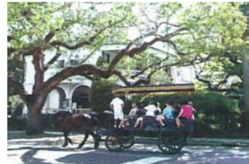
Tour Charleston by Horse and Carriage