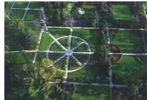
Visit Alden Place And Gardens