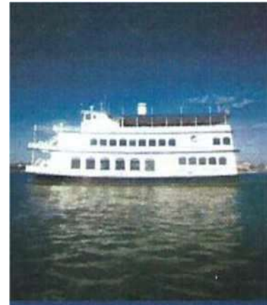
Cruise Around Charleston Harbor