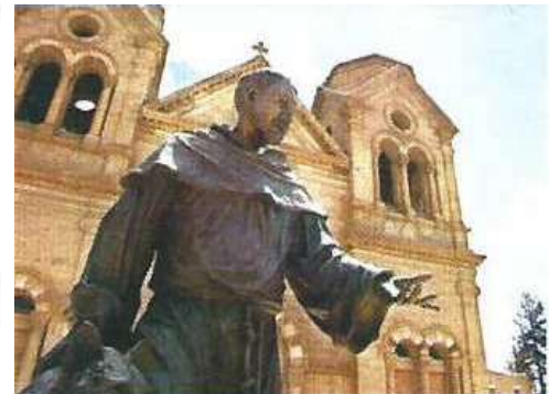
St Francis Cathedral In Santa Fe

Day 9: Today After enjoying a Continental Breakfast, you will depart for home... a perfect time to chat with your friends about all the fun things you've done, the great sights you've seen, and where your next group trip will take you!