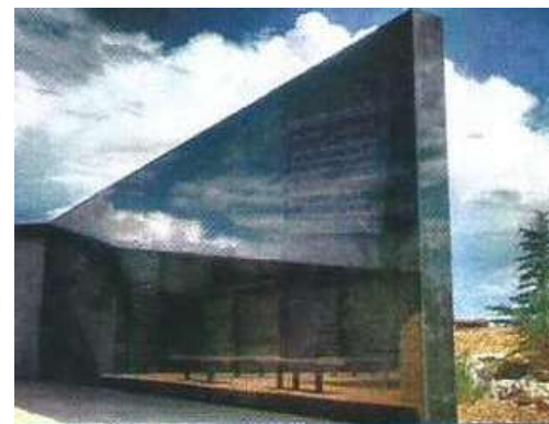
New Mexico Veterans' Memorial