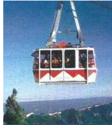
Breathtaking Views of The Sandia Mountains

Day 1: Depart your group's location in a spacious, video and restroom equipped motorcoach, enjoying the great scenery along the way. Then, settle into a comfortable en route hotel for a good night's rest.