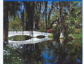
Take in the Picturesque Views of Charleston

Day 7: Enjoy a Continental Breakfast before departing for home... a perfect time to chat with your friends about all the fun things you've done, the great sights you've seen and where your next group trip will take you!