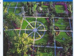
Visit Middleton Place and Gardens