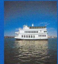
Cruise Around Charleston Harbor