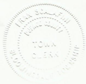
Chairman Board of Trustees